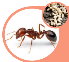
LITTLE FIRE ANT

Khapra beetles are smaller than a grain of rice but are one of the most destructive pests of grains and seeds. They are found in food products, food storage containers and packaging material.